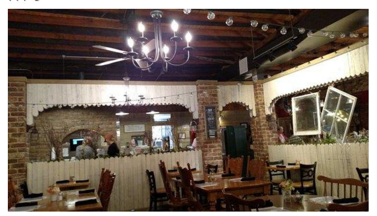
LOVEJOY RESTAURANT & SODA FOUNTAIN. Open for lunch Tues-Sat and enjoy freshly baked goods and step back to 1954 with our old-fashioned soda fountain.